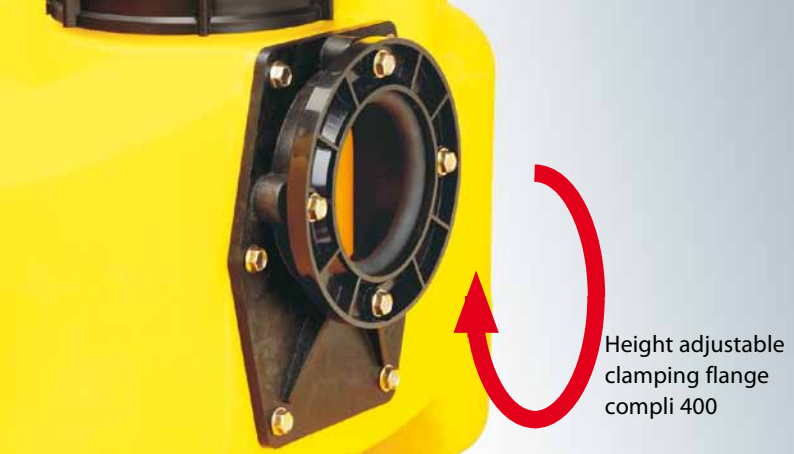
Height adjustable clamping flange compli 400